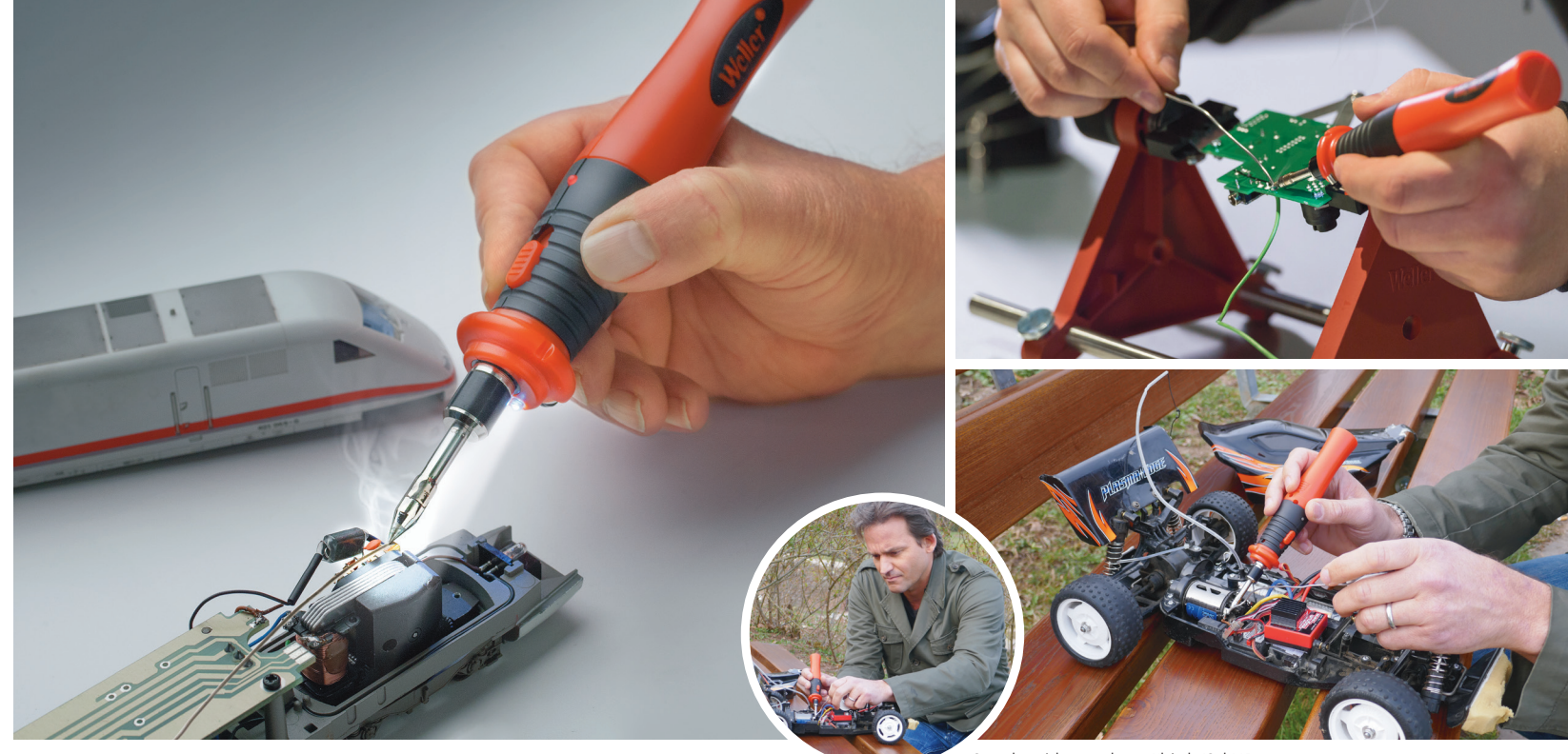
See the video on http://bit.ly/2tkUBTp