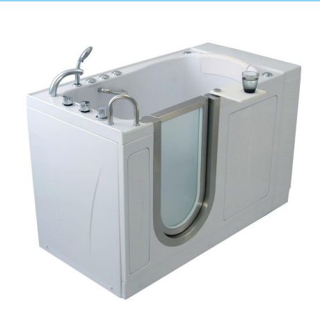
AM3107 Left Hand Door