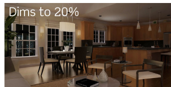
Dims to 20%

Can dim down to 30% or lower. Some minor performance issues may be present. Can use bulb selector switch to trim out flicker*.