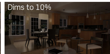
Dims to 10%

No flicker or performance issues dimming down to 20% or lower. Minimal adjustment may be required*.