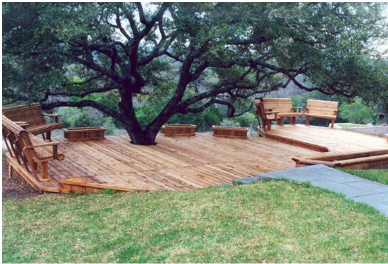
Ready Seal OS-005 Light Oak on Cedar