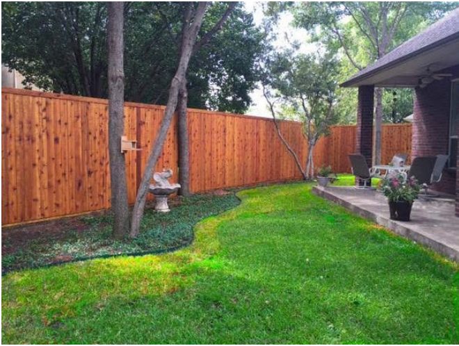
OS-112 Natural Cedar on Cedar