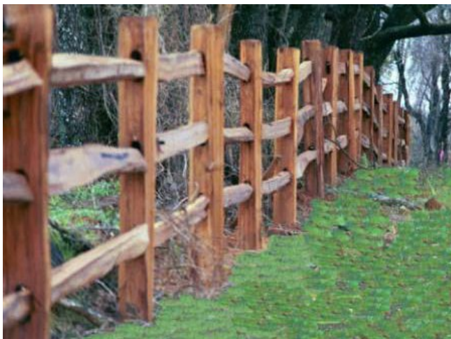
Light Brown On Cedar Split Rail

For Fences & Other Applications, See Narratives Below.