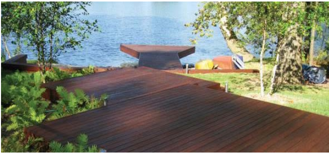
OS-020 Redwood On Ipe'

It's takes up to 10-12 years for Ipê to open up enough for two coats. Annual coatings may be required. See Two Coat Test Method Below!