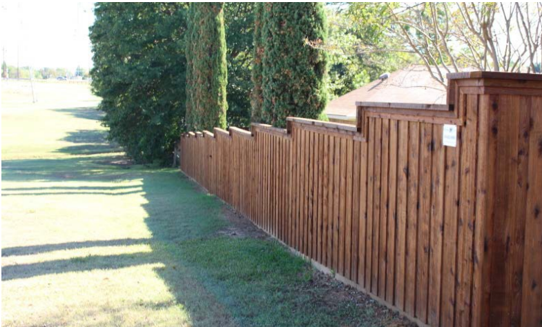
OS- 015 Pecan On Cedar