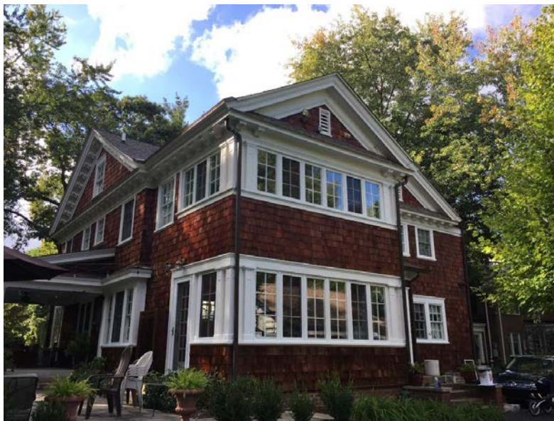
Ready Seal OS-020 Redwood on Cedar Shake Siding

If an acrylic-varnish-silicone type product is completely weathered away, you will only have to clean with 25% household bleach/75%water mixture. Apply mixture waiting 15 minutes and then rinsing thoroughly with garden hose. The substrate must be dried to 12% moisture content or less, then apply Ready Seal. If old product is still present, it will have to be removed. This can be done one of two ways: sand blasting with a pecan shell or corn cob Aggregate media or with a quality stripper, then neutralize with a brightener-oxalic acid... Or you may wait until this varnish-acrylic totally weathers away, then just use the aforementioned bleach and clean prep. Do not sand. This milling will undulate-scallop in the thousands resulting in uneven penetration of Ready Seal. Use a stainless steel swimming pool algae brush or wire brush to take away splintering fibers brushing with the grain. Again, substrate must be dried to 12% moisture content or less, then apply two coat protocol for maximum protection! For Subsequent coatings, repeat prepping process!