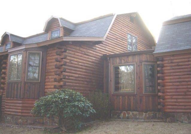
Ready Seal OS-15B Pecan on Pine Logs - Maximize Screen For Full View or Use Slide Bar Below