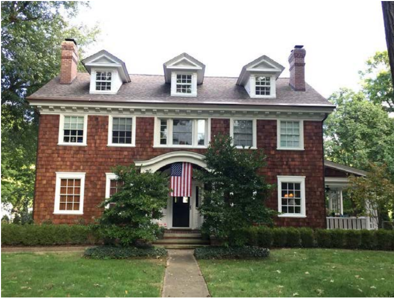
Ready Seal OS-020 Redwood on Cedar Shake Siding