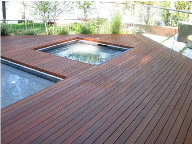
OS-020 Redwood On Ipe'

It's takes up to 10-12 years for Ipê to open up enough for two coats. Annual coatings may be required. See Two Coat Test Method Below!