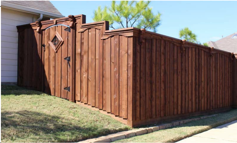
OS-025 Dark Walnut on Cedar