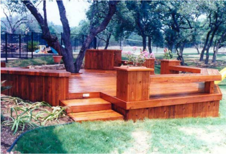
OS-020 Redwood On Western Red Cedar