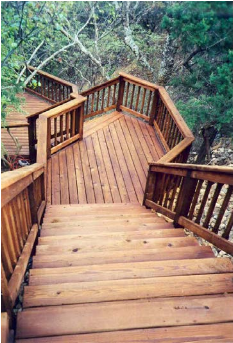
Ready Seal OS-015 Pecan on PT Pine Deck