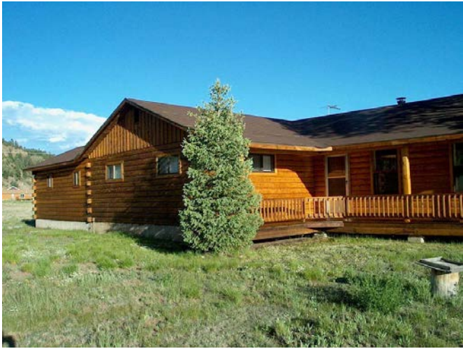
Ready Seal OS-005 Light Oak on Pine Logs – Maximize Screen For Full View or Use Slide Bar Below