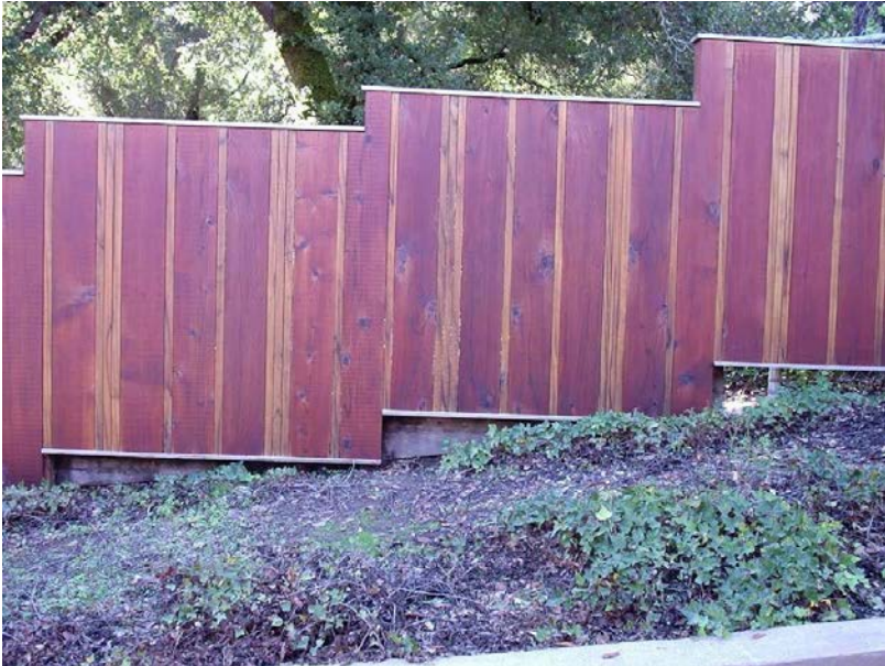
OS-030 Mahogany / Golden Pine on Redwood