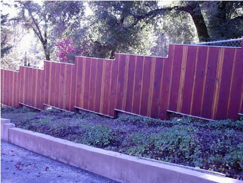
OS-030 Mahogany / Golden Pine on Redwood