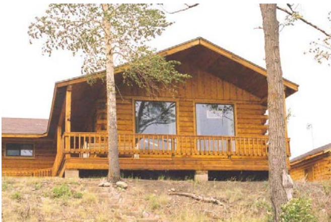
Ready Seal OS-010 Golden Pine On Pine