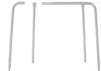
Assemble T Handles & L Handles