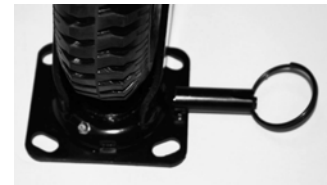
Part # 5 Caster with Lock