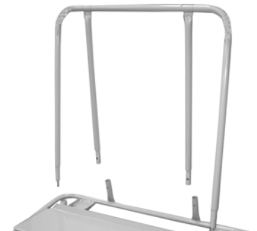
Insert Handles Into Deck