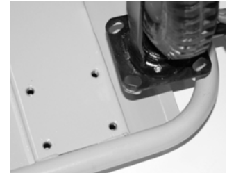
Attach Casters under Deck