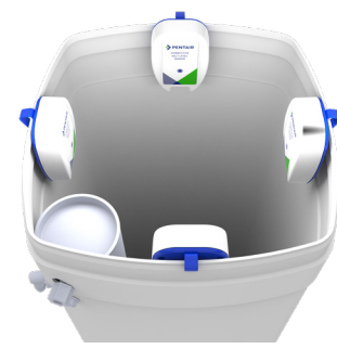
SQUARE BRINE TANK

Note: Visuals above indicate potential positions for the Connected Salt Level Sensor within the brine tank. Only one sensor is needed per brine tank application.