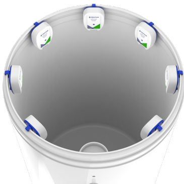
ROUND BRINE TANK