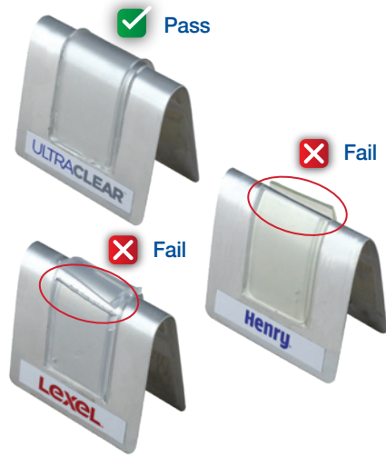
Test Method: C793, 250 hours UV weathering, 24 hours at 26°C. Flexed over 1/2" mandrel

Ultra Flexible & Crackproof Even in Cold Weather