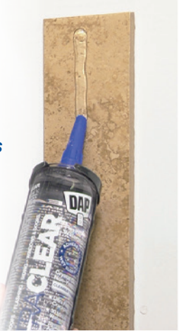
DAP® Ultra Clear™ Applied to Wet Travertine Tile

DAP® Ultra Clear™ is immediately water ready, provides strong multi-surface adhesion and adheres to wet surfaces.