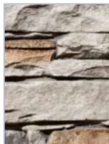
Stacked Stone - Gray