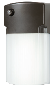
Dusk to Dawn