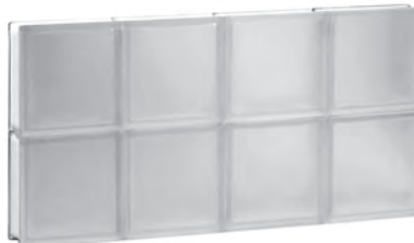
FROSTED PATTERN (FR)

MAXIMUM LIGHT, NO DISTORTION, FULL TRANSPARENCY