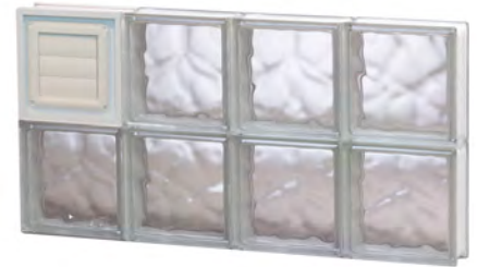
DRYER VENT (DV)

NOTE: DRYER VENT MODEL NUMBERS WILL BE 9 DIGITS LONG