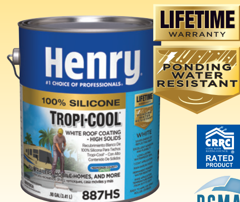
1, 5, & 55 gallon