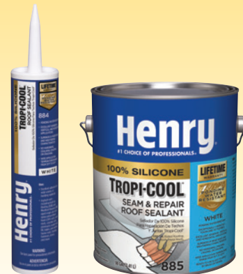
10.1 Fl. Oz. 1 gallon