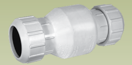
CVSE1, CV-SE2 and CV-SE3