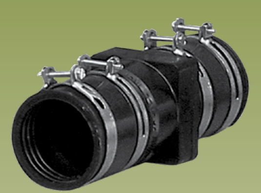
CV-114/112 and CV-SE