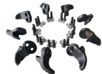
Extra Set Of Teeth Included