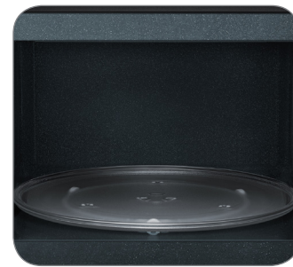
Ceramic Enamel Interior