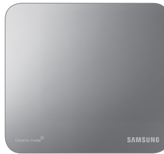
Shiny Mirror Design