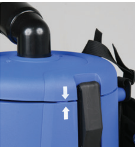
Arrows assist operator with securing canister lid and latches in the correct position. Easy to snap latches allow access to the canister and paper bag.

Onboard tool storage for quick and easy tool change. The complete tool kit is ideal for carpet and hard floors, overhead, and detail cleaning operations.