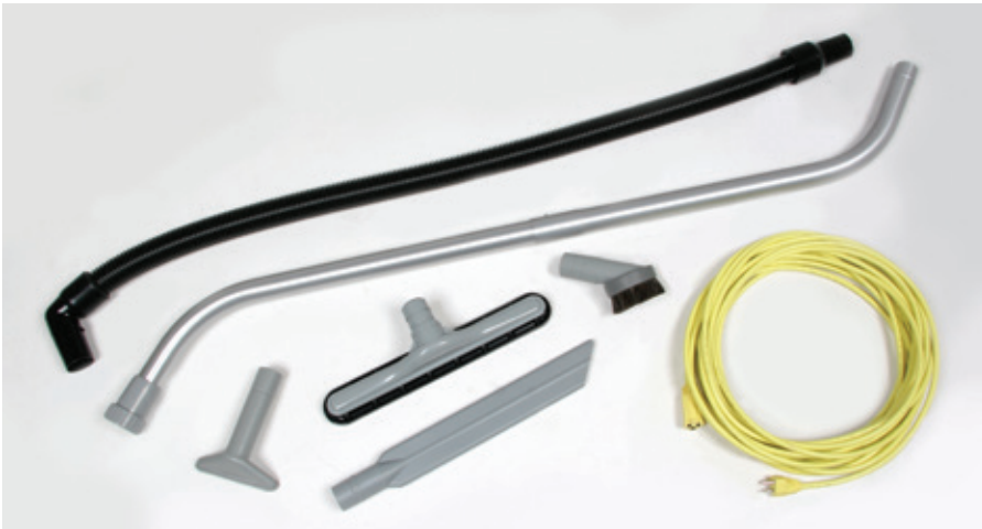
The standard tool kit fits all your cleaning needs. Ideal for carpet and hard floor areas.