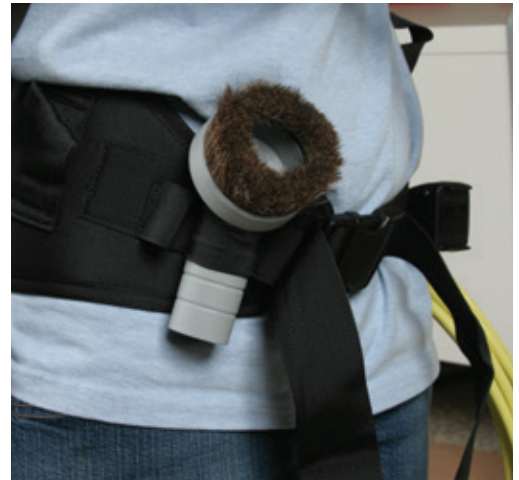
The belt has convenient tool storage.