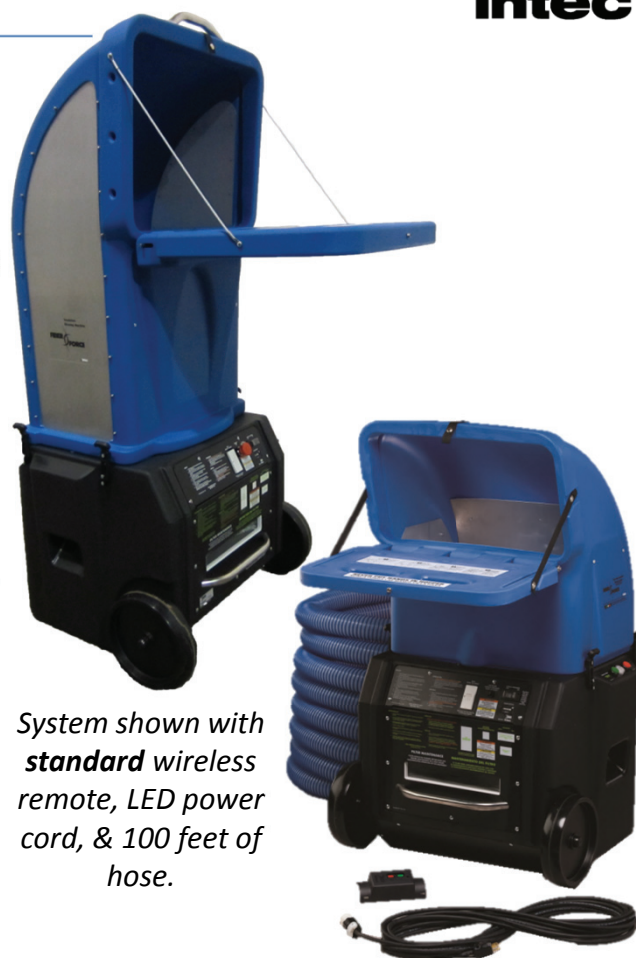
System shown with standard wireless remote, LED power cord, & 100 feet of hose.

The wireless remote enables operation from the installation location without the requirement of taking a cord with you.