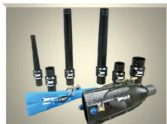
Nozzles & Swivel Hose Connectors