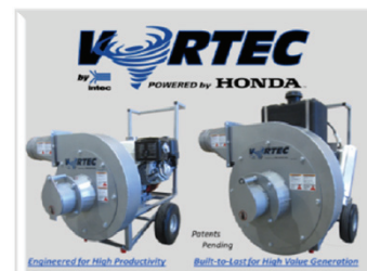
High Powered Vacuums & Generators