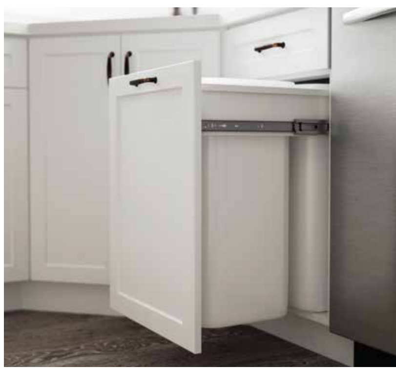
The dual waste bin keeps trash tucked away, keeping the kitchen tidy and floor space open. Recycling is easy with separate bins.