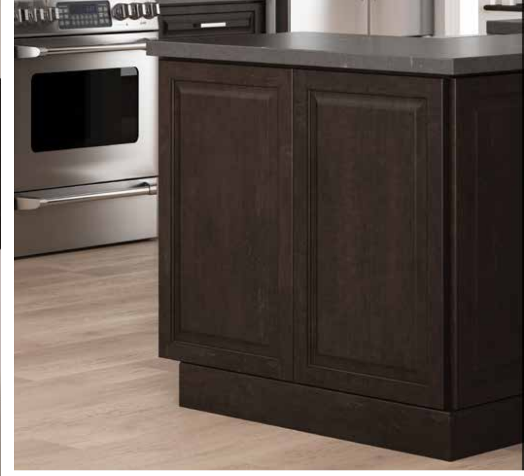
Optional Decorative End Panels let you extend the style of your cabinets with panels that match your door style and finish. Apply to islands, peninsulas, or anywhere you might need a decorative look.