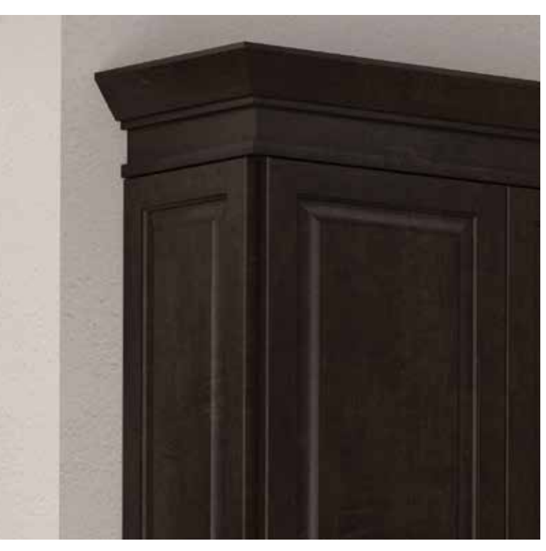
Get that rich, finished look that brings it all together with crown molding available in several styles. Stack them for an extra-special touch.