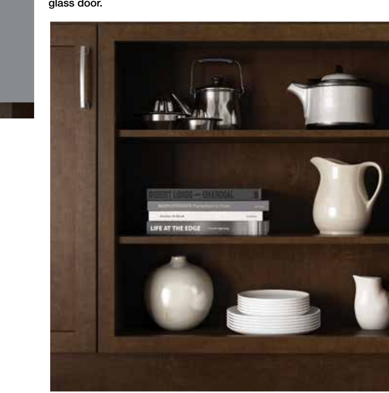
Framed Open Wall cabinets provide open storage for showcasing your favorite decorative pieces, while keeping items within easy reach. Use them for walls or combine creatively with base cabinets in islands and peninsulas.