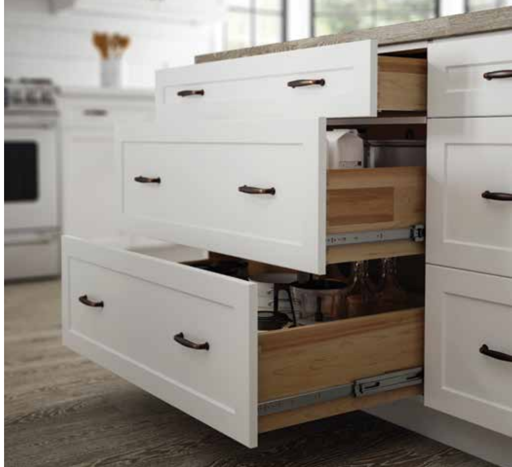
30", 33" and 36" wide drawer bases store bulky pots and pans close at hand. Top drawer is dovetail with soft close glides. The bottom two hardwood drawers feature full-extension heavy duty, soft close glides.