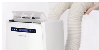
Quick and Easy Installation - Dual Hose for Faster Cooling