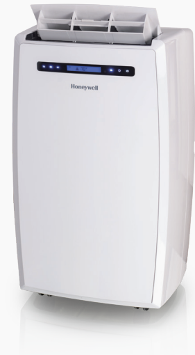
Product Dimensions (in): 18.1 (L) 15.2 (W) 29.3 (H) Net Weight: 75.6 lbs / 34.3 kg

Unlike a fixed AC, this unit requires no permanent installation and four caster wheels provide easy mobility between areas. Plus, the auto-evaporation system allows for hours of continuous operation with no water to drain or no bucket to empty. This model comes with everything needed including two flexible exhaust hoses and an easy-to-install window venting kit. The window vent can be removed when the unit is not in use.