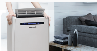
Easy to Maintain, Easy to Store