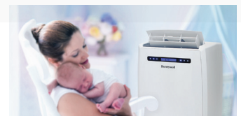
Quiet Operation - Between 51 to 53 dbA