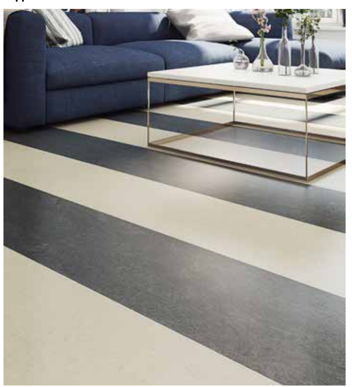
933858 barbados, 933872 volcanic ash