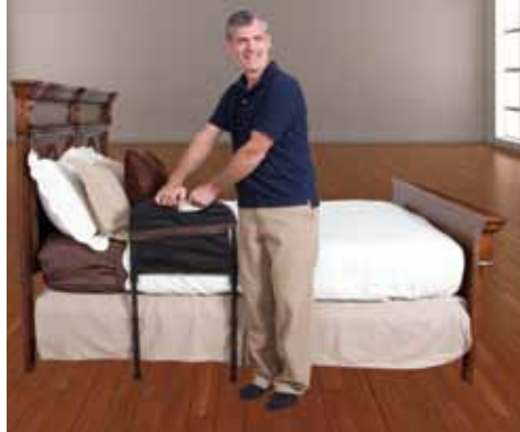
EASILY STAND UP