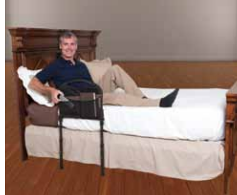
ORGANIZER KEEPS ITEMS CLOSE BY