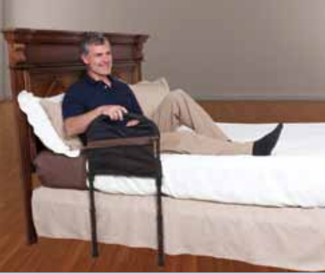
EASILY SIT UP IN BED