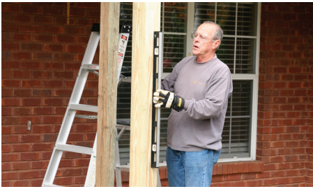
7. Check for plumb.