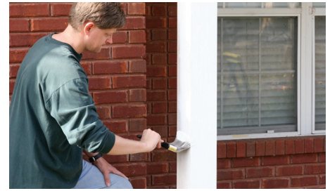
10. Prime with an oil-based primer and paint immediately. You can also stain YellaWood® columns with a high-quality stain with water-repellent.

▲ WARNING: Use extreme care when installing YellaWood® columns, and ensure that the column and temporary support are secure during installation and that the column is fully secure after installation. Supported loads (such as roofs), the columns, or the temporary support can fall or move and cause property damage, serious personal injury, or death.