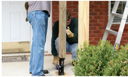
8. After ensuring that the column supports the load and is stable, remove temporary support.