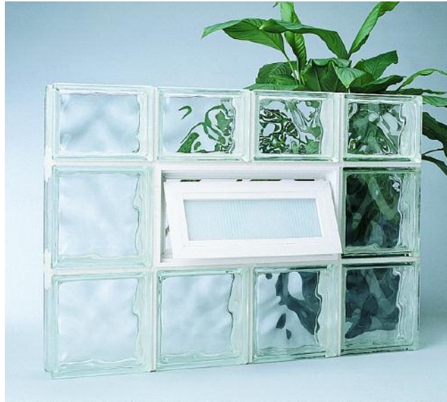
DECORA® Pattern, with its trademark wavy undulations, provides maximum light transmission with subtle visual distortion.

Choose from three distinct patterns, each offering its own unique style, degree of light transmission and privacy. Perfect for replacement or new-window and small-partition applications. Prefabricated panels are available with or without vents.