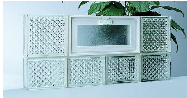
DELPHI® Pattern, with prismatic diamond design, provides moderate light transmission with maximum privacy.