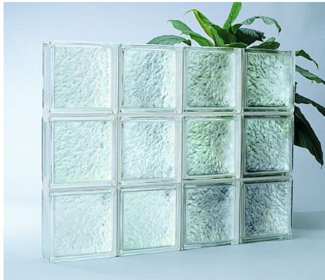
IceScapes® Non-Directional Pattern lets light in without sacrificing privacy. Maximum light transmission with a maximum degree of privacy.