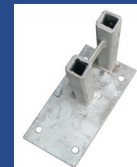
Ground Anchor is made of Heavy Duty Solid Steel Construction