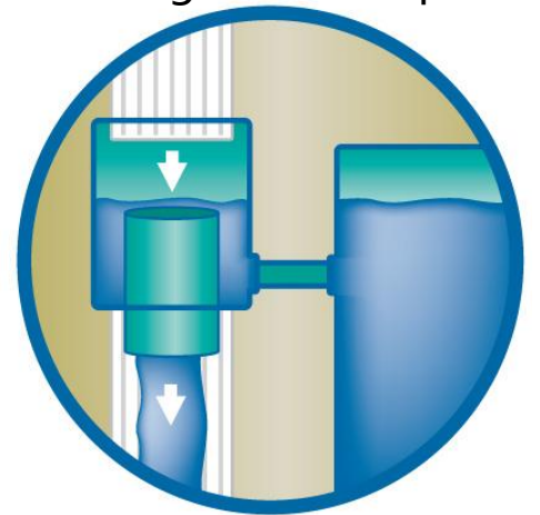
Downspout water diverter eliminates reservoir overflow. When rain barrel reservoir is full the rainwater flows down the downspout