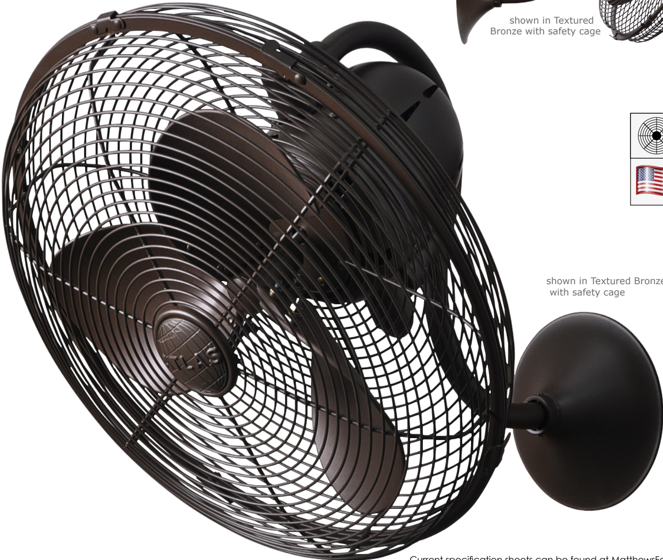
shown in Textured Bronze with safety cage