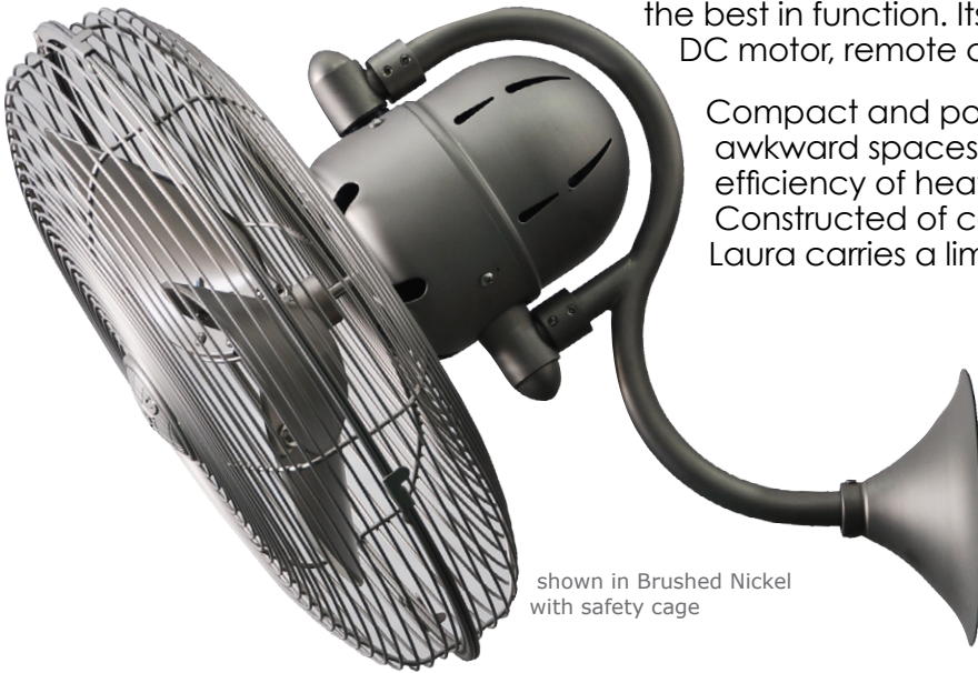
shown in Brushed Nickel with safety cage

Compact and powerful, Laura can be mounted in small, awkward spaces or in front of HVAC ducts to improve the efficiency of heating, ventilation or air conditioning. Constructed of cast aluminum and heavy stamped steel, Laura carries a limited lifetime warranty.