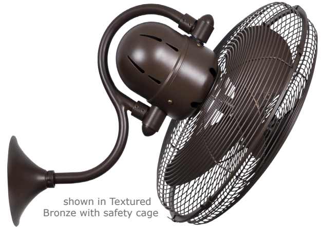
shown in Textured Bronze with safety cage