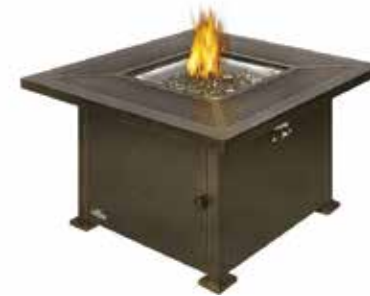
Square - Bronze