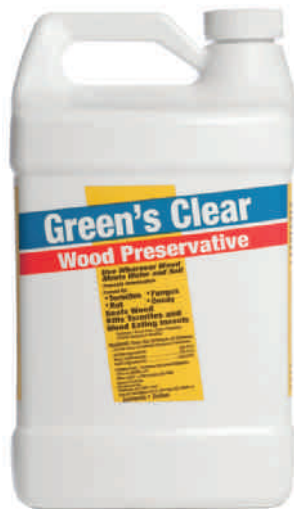
For Interior or Exterior Use.

When color is not an issue, copper products are the best and the most effective solution. When applying the preservative around plants, it's best to cover the plants for complete protection. However, when the preservatives dry, they are perfectly safe to use on planter boxes and greenhouses.