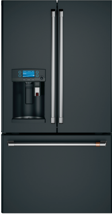
Matte Black with Brushed Stainless handles