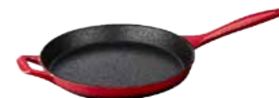
Skillet-Cast Iron Handle Available in all colours .

You might be surprised to know that cast iron frypans make the perfect tarte tatin.