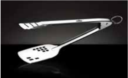
STAINLESS STEEL SPATUTONG 55019