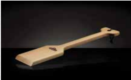
CEDAR GRILL SCRAPER 62051