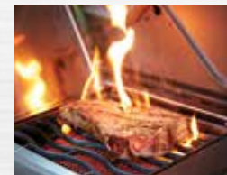
Infrared SIZZLE ZONE Side Burner (SIB MODELS)