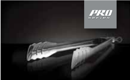
STAINLESS STEEL EASY LOCKING TONGS 55011