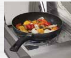
Range Side Burner (SB MODELS)