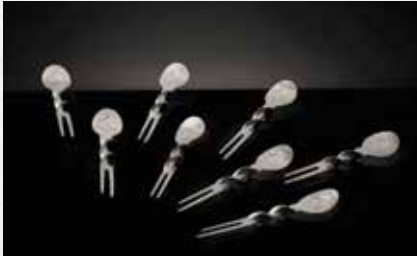
APPETIZER SERVING SET AND CORN FORKS 70041