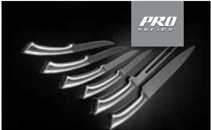
PROFESSIONAL KNIFE / CARVING SET 55206