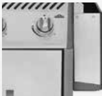
Folding Side Shelves (ALL MODELS)

525 4 BURNERS 425 3 BURNERS 365 2 BURNERS