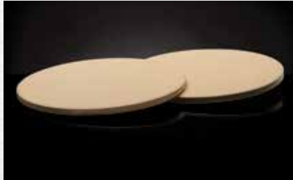
10" PERSONAL SIZED PIZZA / BAKING STONE SET 70000