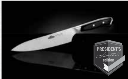
EXECUTIVE CHEF KNIFE 55202