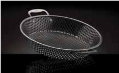
STAINLESS STEEL GRILLING WOK 56026