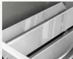
Dual-Level Stainless Steel Sear Plates