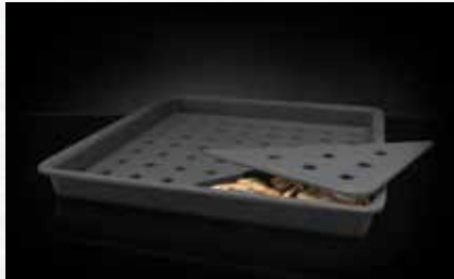
CAST IRON CHARCOAL TRAY 67732