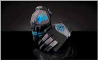
MULTI-USE TOUCHSCREEN GLOVES 62141 (S/M) 62142 (L) 62143 (XL / XXL)