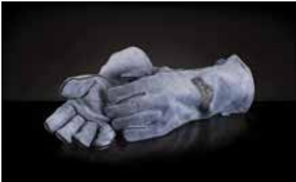
GENUINE LEATHER BBQ GLOVES 62147