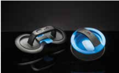
GOURMET BURGER PRESS KIT 70060