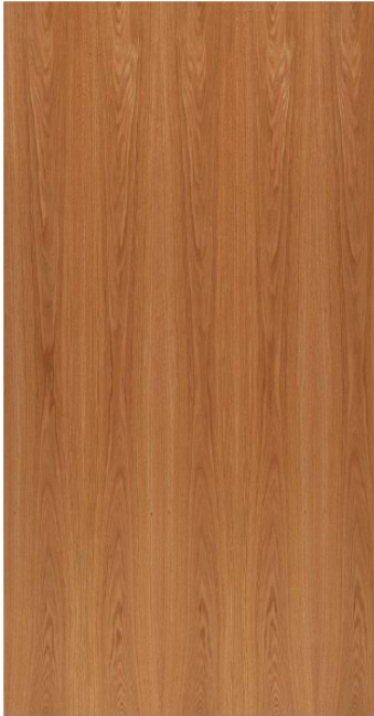
Red Oak Plain Sliced A