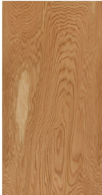
Red Oak Rotary Whole Piece C