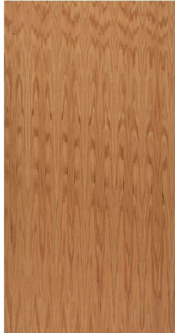
Red Oak Plain Sliced B