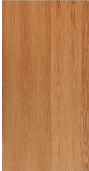
Red Oak Plain Sliced Back 1

Common names: Red Oak, Northern Red Oak, Southern Red Oak; more than 10 other names