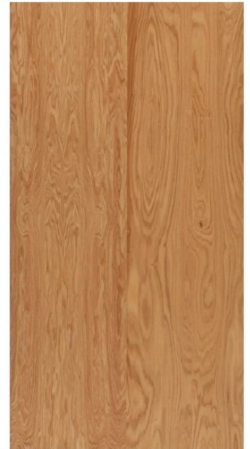
Red Oak Rotary Back 1