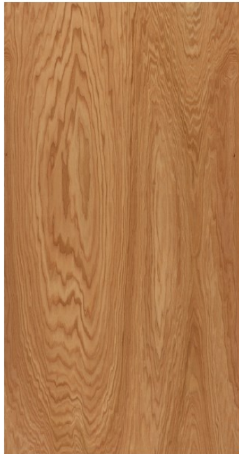
Red Oak Rotary Whole Piece B