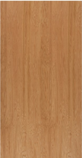
Red Oak Rotary Whole Piece A

Price: $$-$$$ depending on specifications