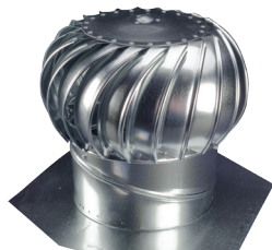
GEB-12 & GT-12 (shown) GALVANIZED STEEL TURBINE † ADJUSTS TO 7/12 ROOF PITCH AVAILABLE IN MILL ONLY