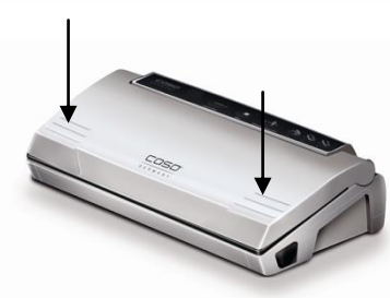
Step 2: Press the cover down firmly on each corner of the top cover until it locks into place with an audible click. To seal, press the Seal Only Button. To vacuum and seal, press the Vacuum & Seal Button.