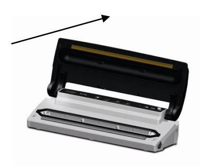
Step 1 : Open the lid and insert the open side of a compatible bag into the clear plastic vacuum chamber.

After each sealing session and before starting up, check to make sure the unit and all accessories are clean and free of leftover food. Follow the cleaning instructions on in Chapter 6 .