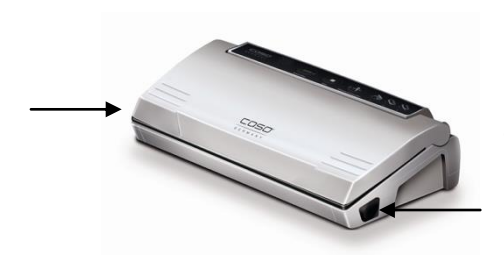
Step 3: Once the Sealing Indicator Light is no longer lit, press the Cover Unlock Buttons to unlock the top cover.