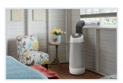
Sleek New Design

Innovative slanted louvers direct airflow in an upward, circular motion, allowing for even cooling of the entire room.