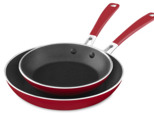
8"/10", 10"/12" skillets twin pack