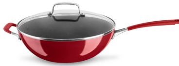
6.0-qt chef's pan with lid