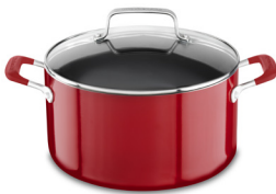
6.0-qt low casserole with lid