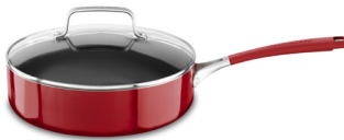
3.0-qt sauté pan with lid