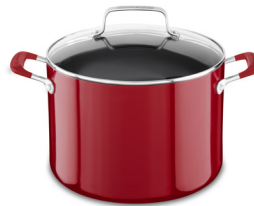
8.0-qt stockpot with lid