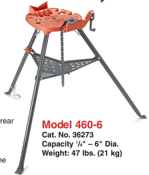
Model 460-6 Cat. No. 36273 Capacity 1/8" – 6" Dia. Weight: 47 lbs. (21 kg)