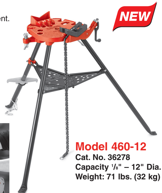
Model 460-12 Cat. No. 36278 Capacity 1/8" – 12" Dia. Weight: 71 lbs. (32 kg)