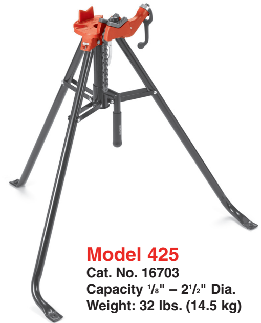
Model 425 Cat. No. 16703 Capacity 1/8" – 2 1/2" Dia. Weight: 32 lbs. (14.5 kg)