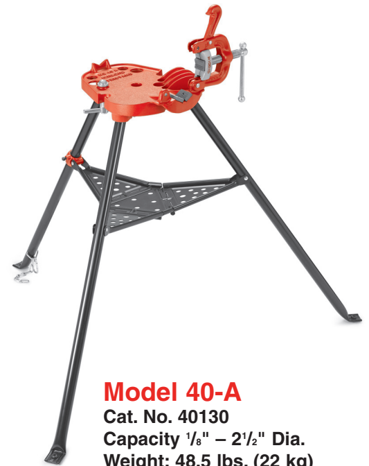
Model 40-A Cat. No. 40130 Capacity 1/8" – 2 1/2" Dia. Weight: 48.5 lbs. (22 kg)