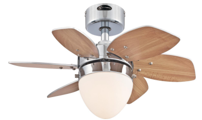
Reversible Beech Finish Blades