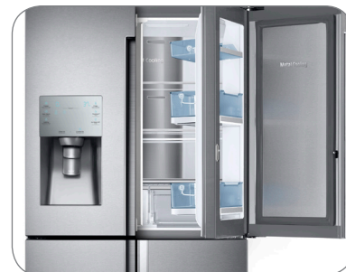
Food Showcase Door with Metal Cooling