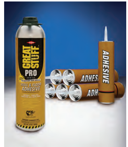
Cream in color, GREAT STUFF PRO™ Wall & Floor Adhesive is available in 26.5 oz (751 g) cans. One can of GREAT STUFF PRO™ Wall & Floor Adhesive equals 4-6 nominal quart tubes of traditional caulk adhesive, helping stretch the building budget even farther.

GREAT STUFF PRO™ Wall & Floor Adhesive can be applied in a single 1/2" bead on joists and studs. For optimum performance, apply adhesive bead in a continuous zigzag, ensuring adhesive layer will completely cover joists and framing on sistered joints or studs or wherever wood panels and drywall edges meet.