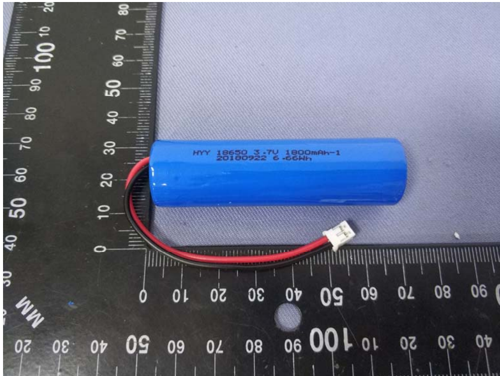
Figure 1 Top view of battery