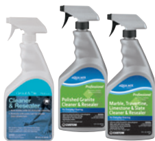
Grout & Tile Cleaner & Resealer