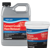
Cement Grout Haze Remover Sulfamic Acid Cleaner

Pre-seals tile and stone before grouting to make grout clean-up easier and help eliminate grout haze.