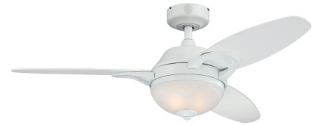
Reversible White Finish Blades