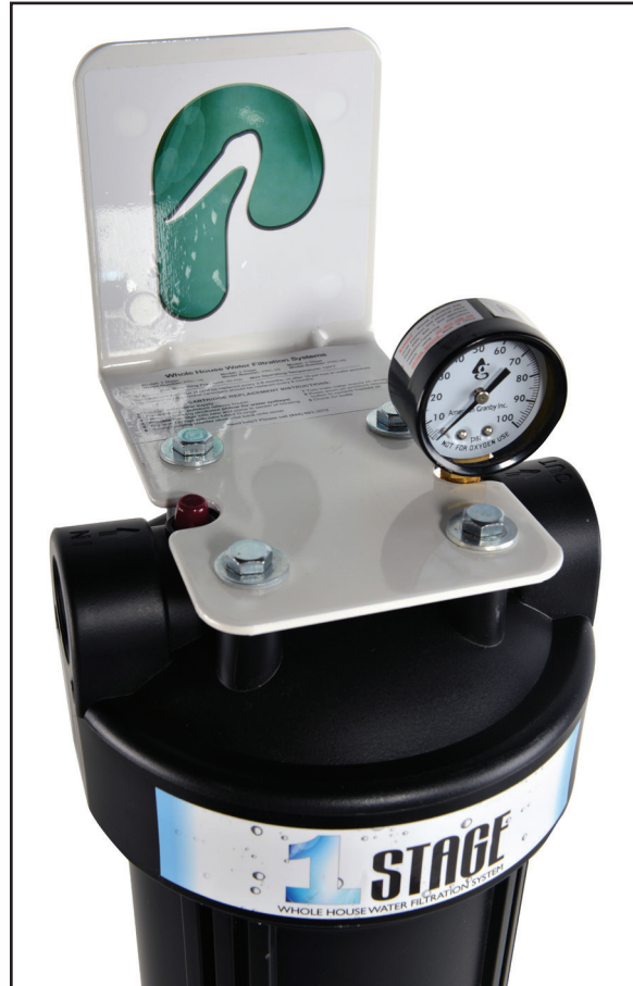
Top of Pelican 1 Stage System

If this or any other system is installed in a metal (conductive) plumbing system, i.e. copper or galvanized metal, the plastic components of the system will interrupt the continuity of the plumbing system. As a result any errant electricity from improperly grounded appliances downstream or potential galvanic activity in the plumbing system can no longer ground through contiguous metal plumbing. Some homes may have been built in accordance with building codes, which actually encouraged the grounding of electrical appliances through the plumbing system. Consequently, the installation of a bypass consisting of the same material as the existing plumbing, or a grounded "jumper wire" bridging the equipment and reestablishing the contiguous conductive nature of the plumbing system must be installed prior to your systems use.