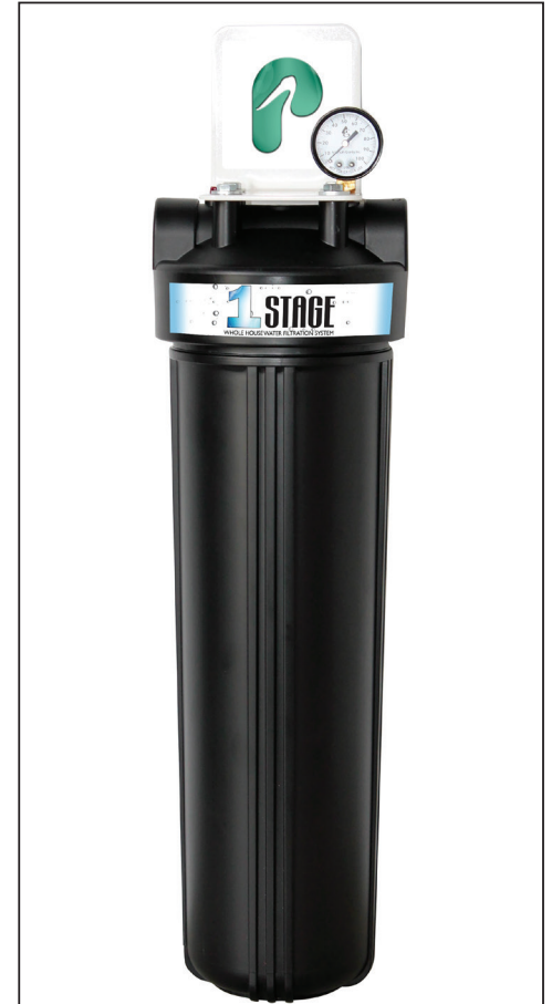
Front of Pelican 1 Stage System