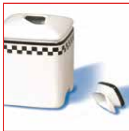
Ceramics & Glass