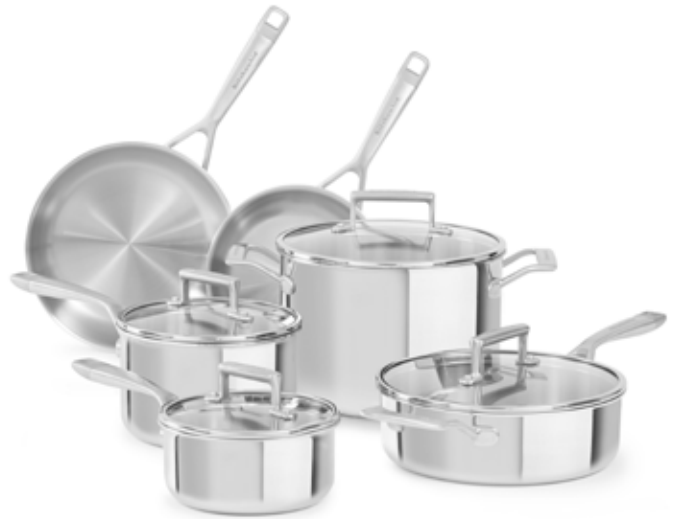
10-PIECE SET SHOWN