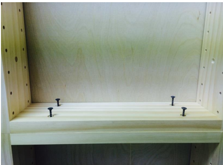
Image 2 Tack on Back Panel