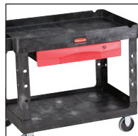
4593 SINGLE FULL EXTENSION DRAWER

CASTER OPTIONS ARE AVAILABLE ON MEDIUM AND LARGE CARTS