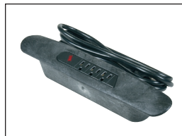
4590 3-OUTLET POWER STRIP