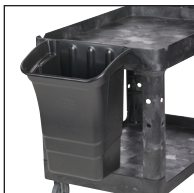
3353-88 8 GAL REFUSE BIN