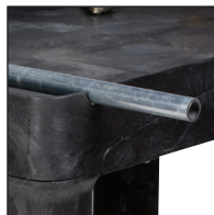
4520-88 HEAVY-DUTY UTILITY CART

V-notch holds pipe securely for safe cutting.