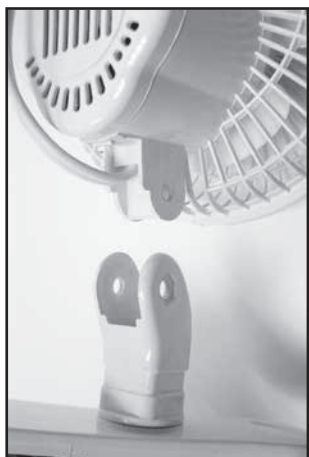
Place Clip Base on to Fan