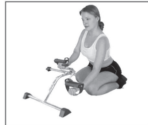
HAND ROWING EXERCISE