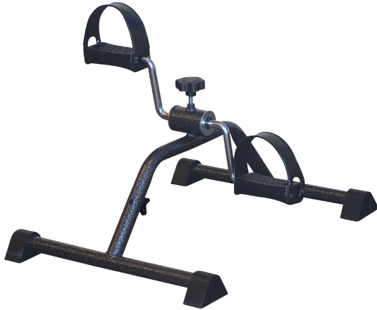
REF. 10270SV-2 Shown Exercise Peddler