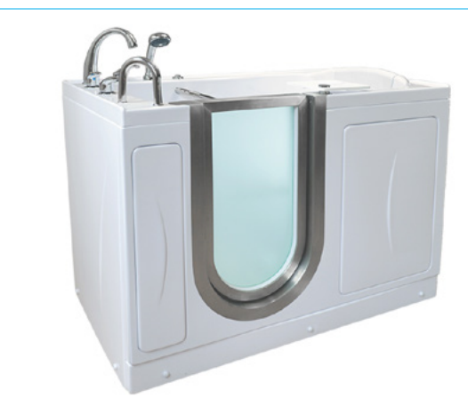
AM3107 Left Hand Door